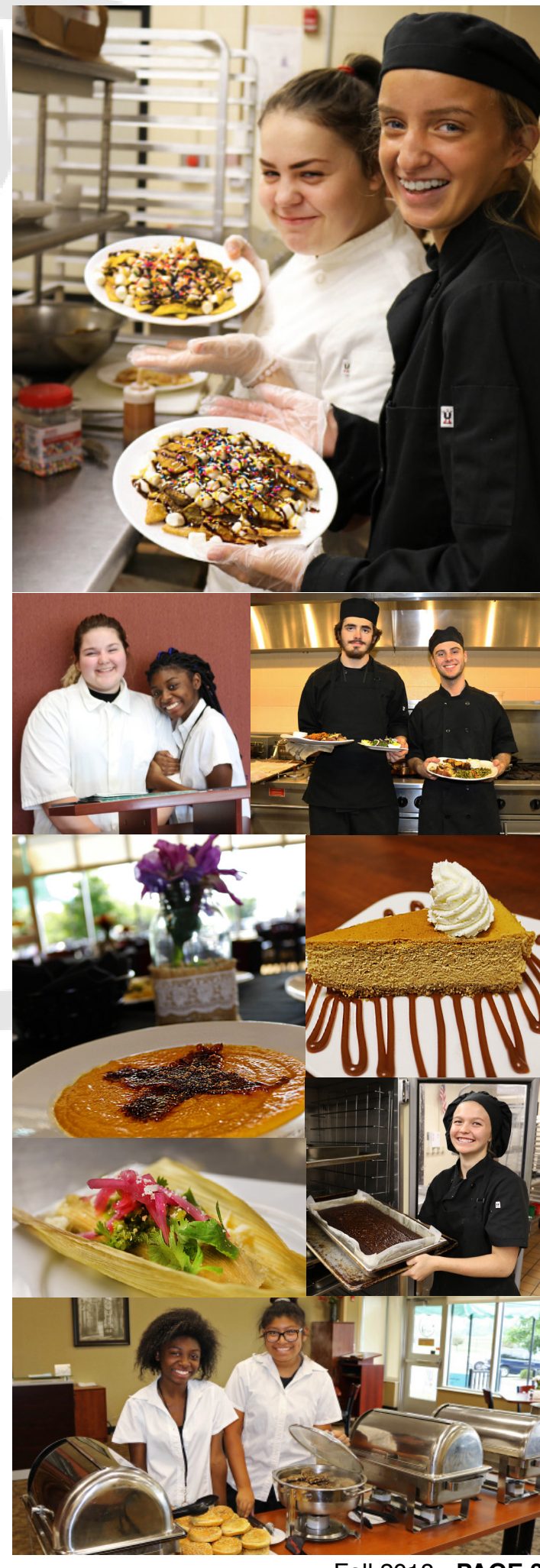
Fall 2018 - PAGE 3

Call 317-888-4401 ext 305 today to book your reservation.